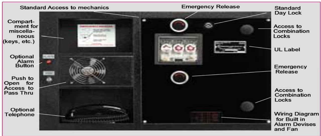
Diagram of Inside Vault Door Panel